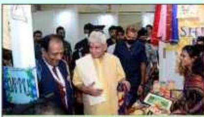
Sh. Manoj Sinha, Lieutenant Governor of Jammu and Kashmir