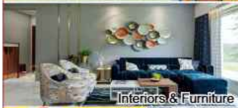
Interiors & Furniture