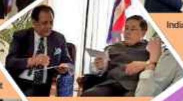
MSME Summit Guwahati-Assam