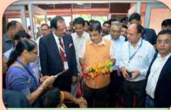
Sh. Nitin Gadkari, Minister of Road Transport and Highways