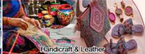
Handicraft & Leather