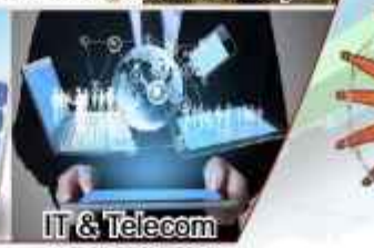
IT & Telecom