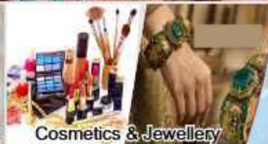
Cosmetics & Jewellery