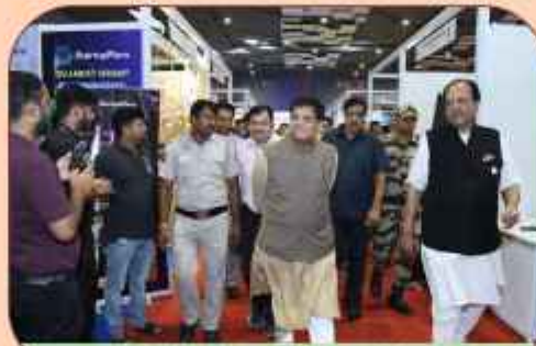
Sh. Piyush Goyal, Minister of Commerce & Industry