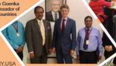
Indian Embassy in USA