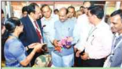
Shri OM Birla, Speaker Lok Sabha