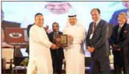
H.E. Saoud Al Saqi, Director General of Free Zones Authority of Ajman with Sh. Chandrababu Naidu, President of International Who Who Federation