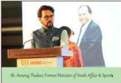
Sh. Anurag Thakur, Former Minister of Youth Affairs & Sports