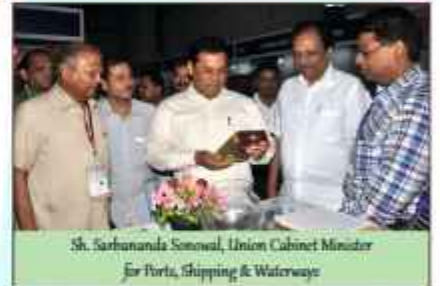
Sh. Sarbananda Sonowal, Union Cabinet Minister for Ports, Shipping & Waterways