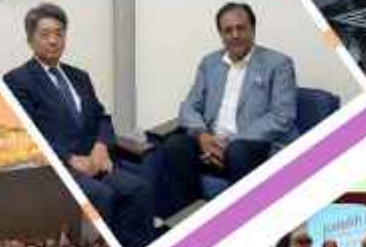
MSME Expo Ladakh