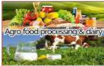
Agro food processing & dairy