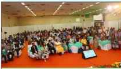
MSME Expo Summit Conference Hall