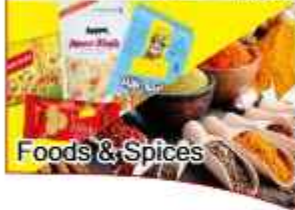
Foods & Spices