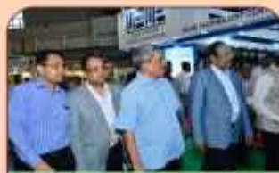
Sh. Manohar Parrikar, Minister of Defence