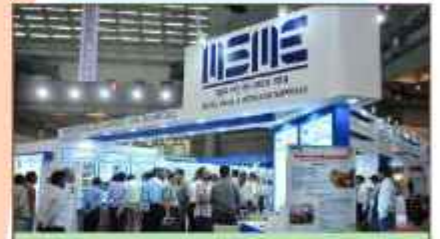
MSME Expo Stalls