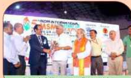
Sh. Gajendra Shekhawat, Minister of Tourism & Culture & Sh. Jai Bhagwan Goyal