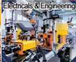
Electricals & Engineering