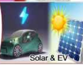
Solar & EV