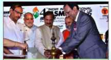
Dr. Mahesh Sharma, former Union Minister of Tourism & Culture